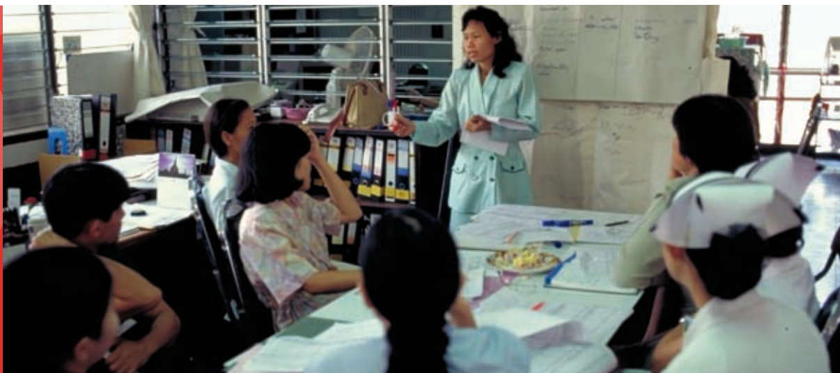
An AIDS information session for health-care workers at the city hospital in Ho Chi Min City, Viet Nam.

Tens of millions of women, men and children are living with HIV today, making AIDS one of the great health and human development issues of our time. Unlike most other health crises, however, HIV largely strikes working-age people in the prime of life.