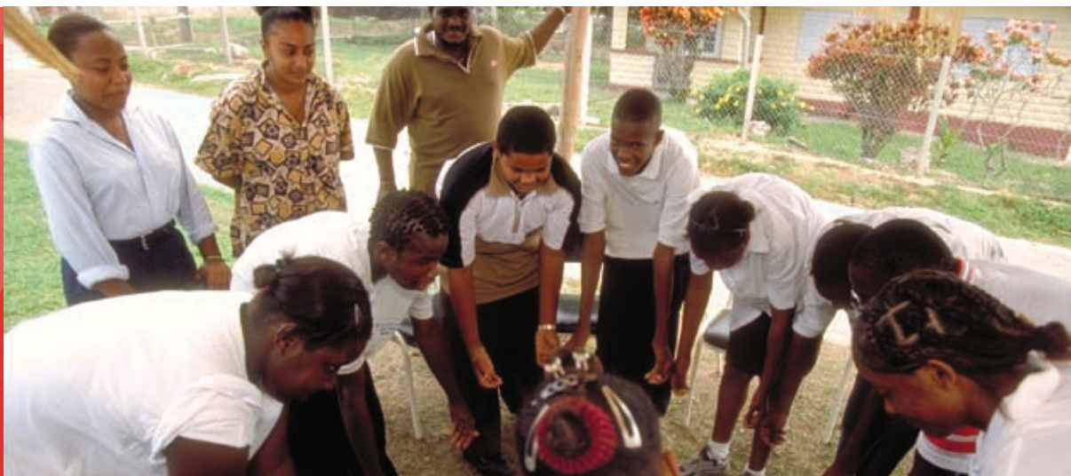
Peer Education Programme in Toco, Trinidad.

“AIDS is the defining moral issue of our time and businesses must play a critical role in the fight against the global spread of the epidemic. The business community is uniquely positioned to use our influence, resources and leadership to challenge stigma, promote prevention and facilitate treatment.”