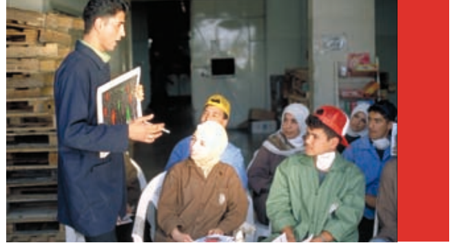
Group meeting on AIDS prevention in a factory in Amman, Jordan.

The countries that are most severely affected by HIV today were "low-prevalence" countries not long ago. Today's low prevalence, left unchecked, can rapidly become high prevalence with consequent social and economic costs. World Bank data show that, once HIV prevalence exceeds 4–5%, it escalates rapidly.