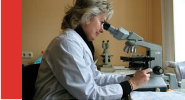
Lab technician looking at a blood test for HIV through a microscope at the Sanam clinic in Moscow.

According to the Financial Times , economists at a major mining and extraction company have estimated that the cost of not providing antiretroviral drugs for an HIV-infected employee, through absenteeism, early retirement, treating AIDS-related conditions, death benefits and recruiting replacements, is about US$ 32 000 per person 2 .