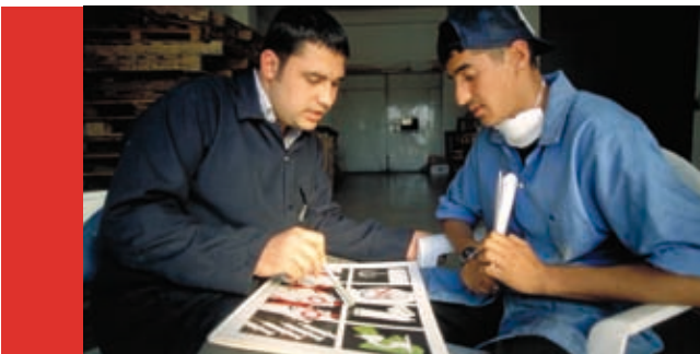
One-to-one meeting on AIDS prevention in a factory in Amman, Jordan.