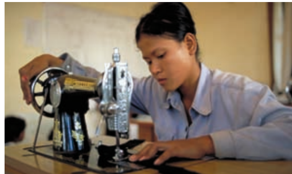
A young street child learning to use a commercial sewing machine at Mith Samlanh/Friends in Phnom Penh.

Being part of an effective AIDS response generates goodwill and demonstrates a company's commitment to strong corporate citizenship and to the well-being of its employees, customers and communities. Studies indicate that employees strongly appreciate when their company and senior management are involved in social causes. Companies working in countries heavily affected by AIDS note improvements in productivity, morale and staff turnover when they take an active, visible role in the AIDS response.