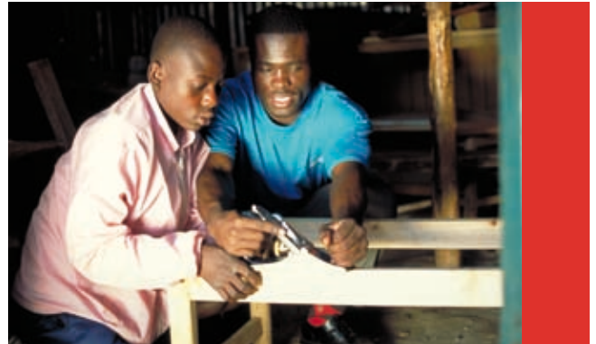
Skills training for HIV orphans and adolescents in a carpentry workshop, Kenya.

UNAIDS has unique experience in uniting organizations both large and small in the AIDS response. Through the UNAIDS secretariat, its country offices, and its ten cosponsors, UNAIDS engages government, civil society and the private sector in the global response to AIDS, in more than 75 countries.