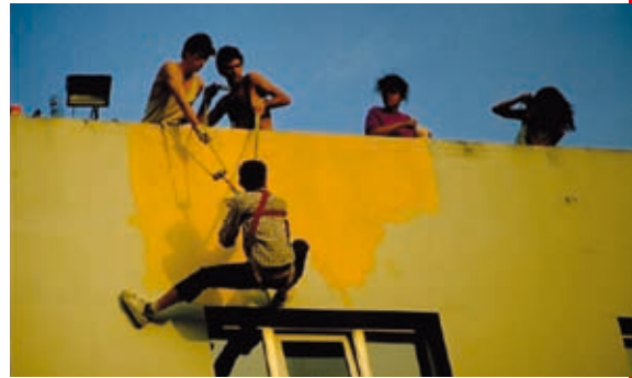
Youth painting in precarious working conditions in India.

A World Economic Forum (WEF) survey of nearly 11,000 business leaders in 117 countries reveals growing concern that HIV will seriously affect the global business community. Nearly half (46%) of the business leaders surveyed in the 2005–2006 report, "Business & HIV/AIDS: A Healthier Partnership?" said they expect the disease to impact their operations over the next five years, an increase of nine percentage points over the response of business leaders just one year earlier.