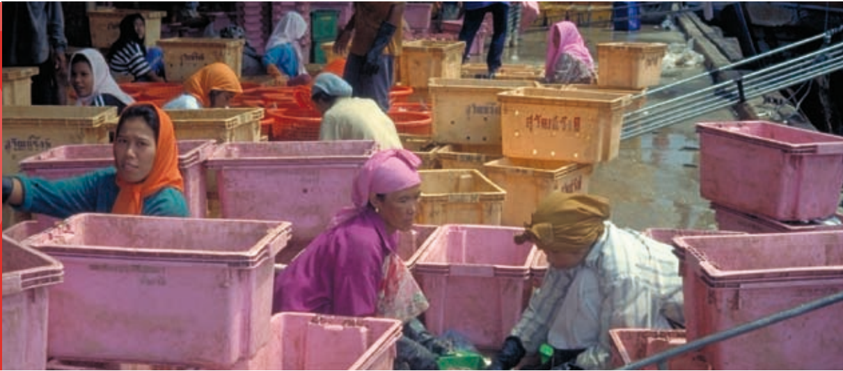
Workers sorting out the daily catch on the wharf, Thailand.

Every business can contribute to the AIDS response depending on its size, type of workforce, geographical range, financial strength and core capabilities. While models for partnership are practically limitless, activities often fall into one of four main categories: workplace programmes, advocacy, cash donations and in-kind donations.